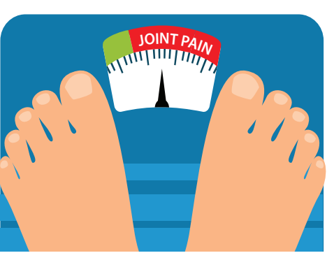
No. 1 thing people can do to maintain healthy joints is control their weight.